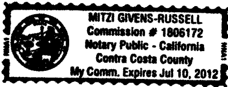
Place Notary Seal Above

Signature [Handwritten Signature] Signature of Notary Public