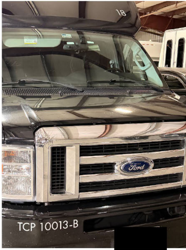
Attachment 7: Photos showing corrected TCP display for vehicles 117027P, 117028P, and 77811C4.