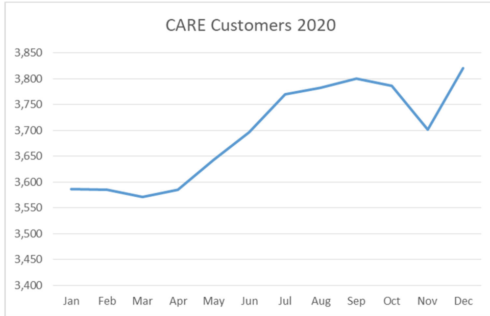
Table I.B. Estimated Eligible CARE Customers