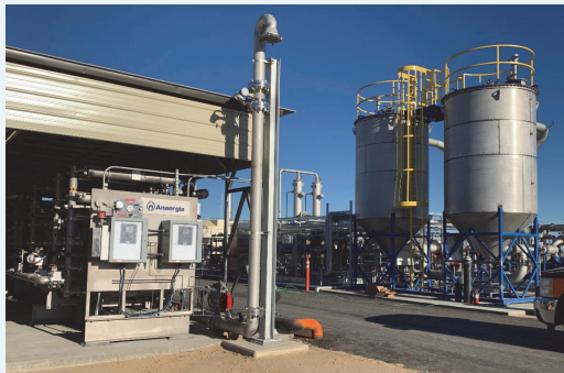
The new facility at the VWVRA will convert raw biogas to pipeline-quality RNG.