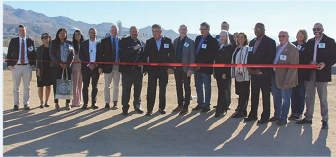
Representatives from the VWVRA, SoCal Biomethane, Southwest Gas and community stakeholders are pictured above at the commissioning event.

In 2021, Southwest Gas was honored to partner with the Victor Valley Wastewater Reclamation Authority (VWVRA) on its first renewable natural gas (RNG) project in California. The VWVRA facility will introduce RNG to Southwest Gas' system. In January 2022, Southwest Gas was joined by partners from VWVRA and other key stakeholders to commission the facility.