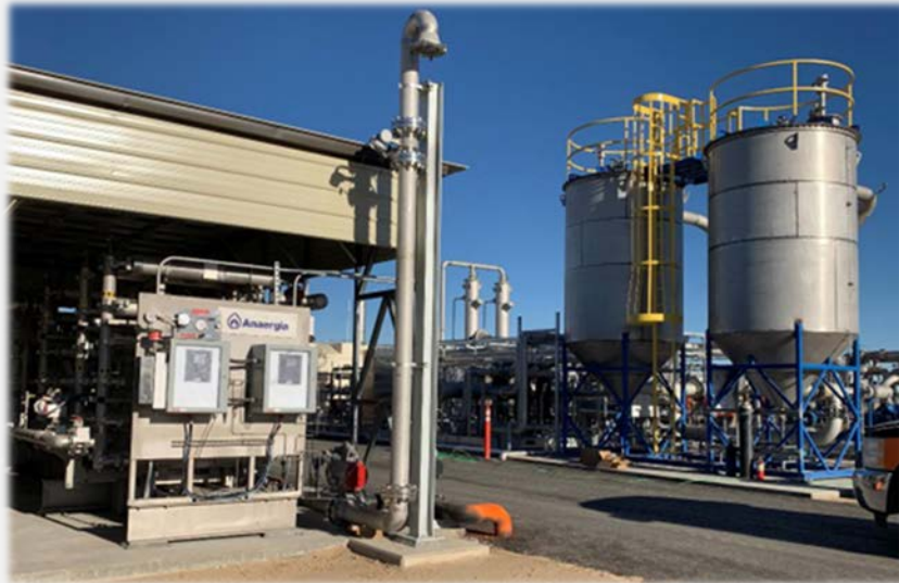
The facility at the VWVRA in Victorville, CA will convert raw biogas into pipeline-quality renewable natural gas.

Hydrogen – In September, Southwest Gas (along with two other California utilities), submitted a joint application to the Commission to seek approval for a hydrogen blending project in Truckee, California. If approved, the project will provide another opportunity to make a positive impact in our community.