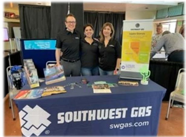
Representatives from Southwest Gas participate in the High Desert Opportunity Summit.