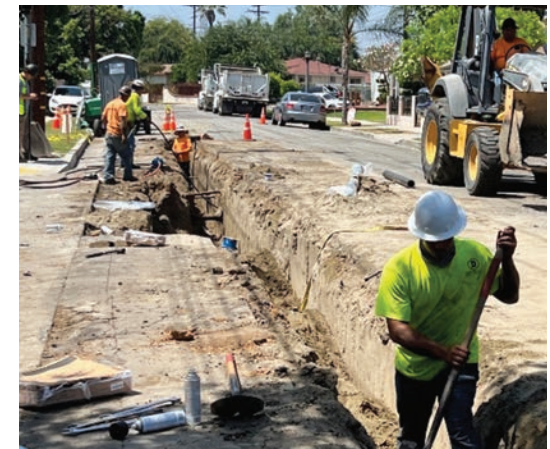
Project work performed and completed by Pivotal Adaptive (Inspection and GIS) and D Corp Construction (Contractor).