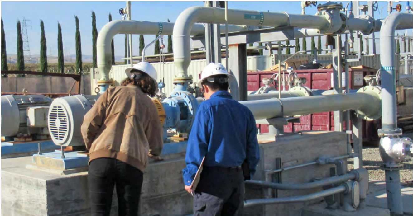
CPUC inspectors in the field.