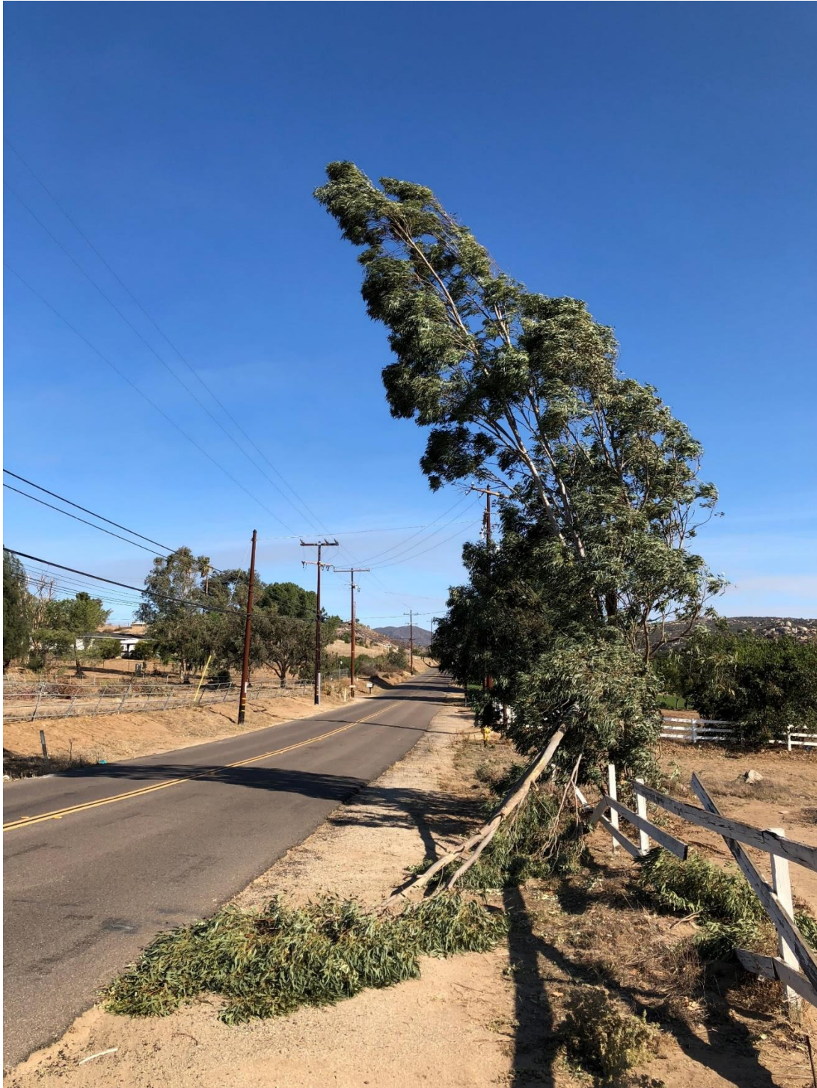
Large Eucalyptus Limb Adjacent to C237 in Ramona – Peak Wind Gust 50 mph at GOS and at SSO