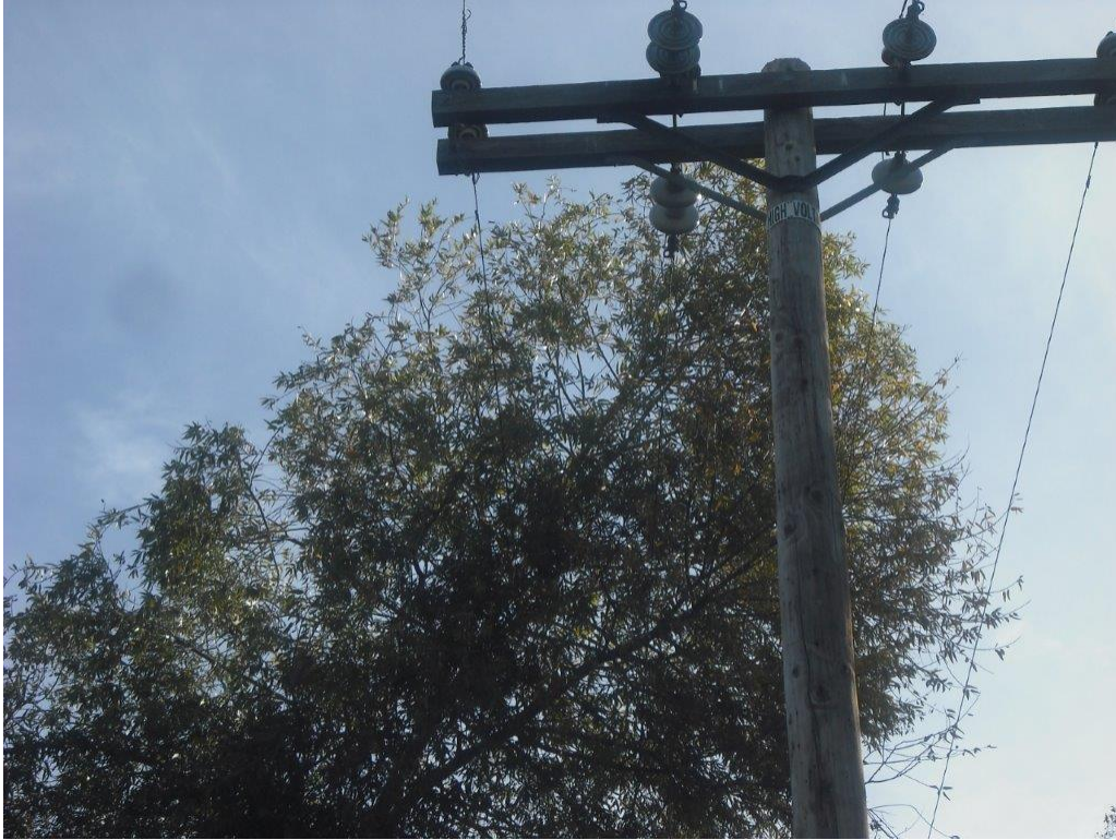
Wind-related damage to C1001