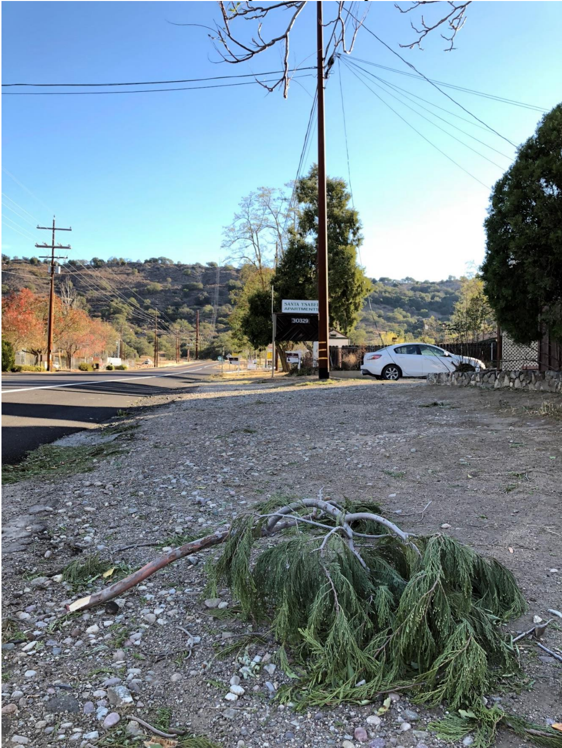
Tree Branch (Foreground) and Downed Telco (Background) Under C222 in Santa Ysabel – Peak Wind Gust of 64 mph at IJP and 61 mph at WSY