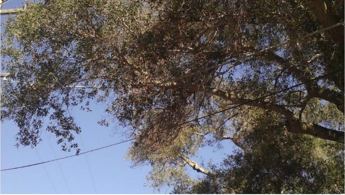
Tree damage to C908