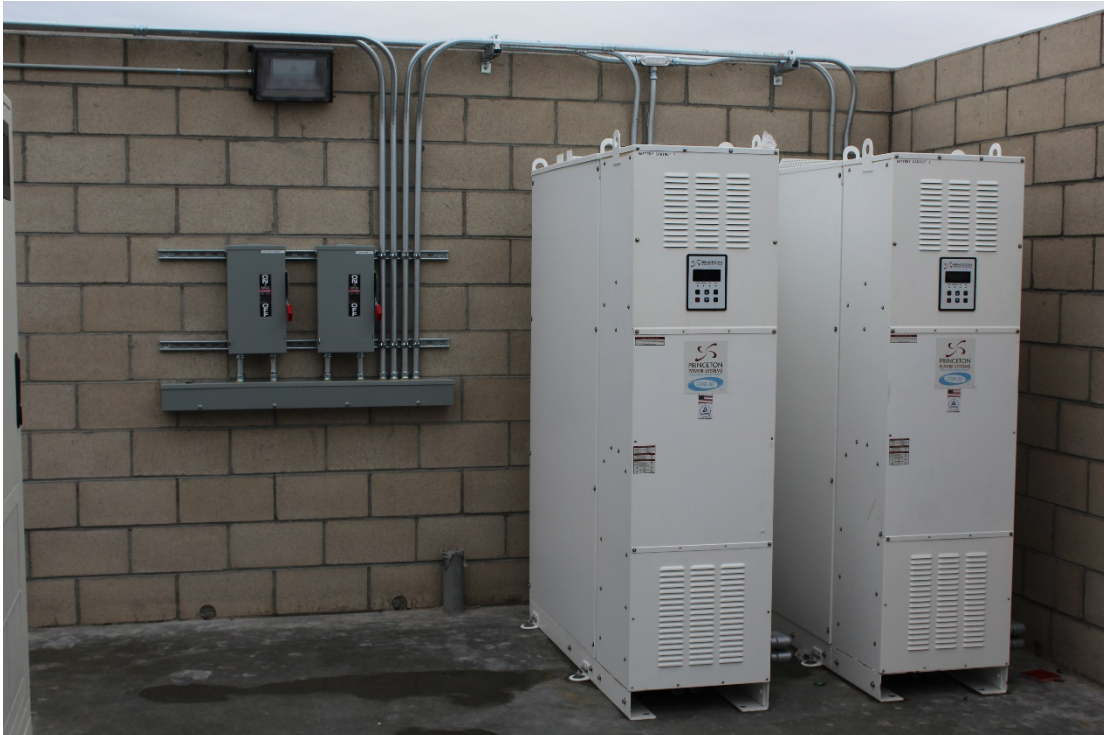
Image 1: Two Princeton Power Pi32 Energy Storage Systems. Each energy storage system is rated at 30 kW / 44 kWh and utilizes two BMW i-3 22 kWh battery packs.

Most of the Q1 2019 activity on the project was focused on integrating the second-life energy storage systems with the site and commissioning the systems to be ready for full operation. EVgo worked with project partners MaxGen Energy Services, Princeton Power Systems, and ChargePoint to bring the battery systems to full operation and has received a signed interconnection agreement with Southern California Edison as of 3/27/19.