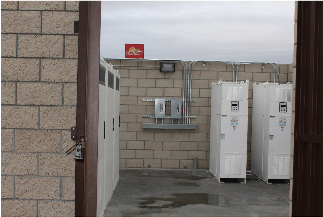
Image 2: Energy storage systems as seen from door of equipment enclosure.

EVgo has been provisionally operating the energy storage equipment for commissioning purposes and has observed satisfactory operation of all devices. The energy storage systems respond to site level demand readings based on how much power is being demanded by the charging equipment on site. Since the site has both energy storage and solar power EVgo can charge the batteries using solar power during the day.