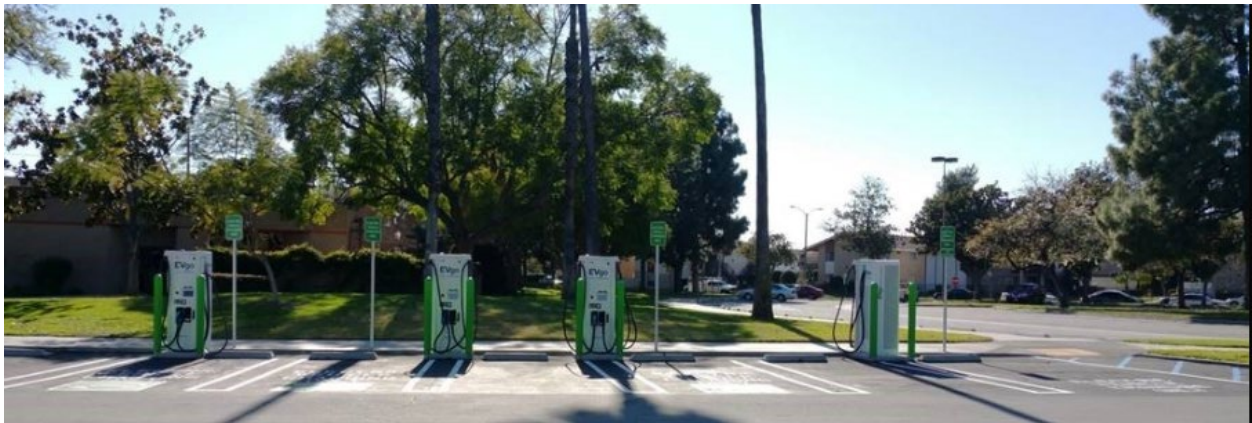
Brookhurst Community Center, 2271 Crescent Avenue, Anaheim

EVgo energized the first EACH hub at the Brookhurst Community Center in the City of Anaheim in February 2019.