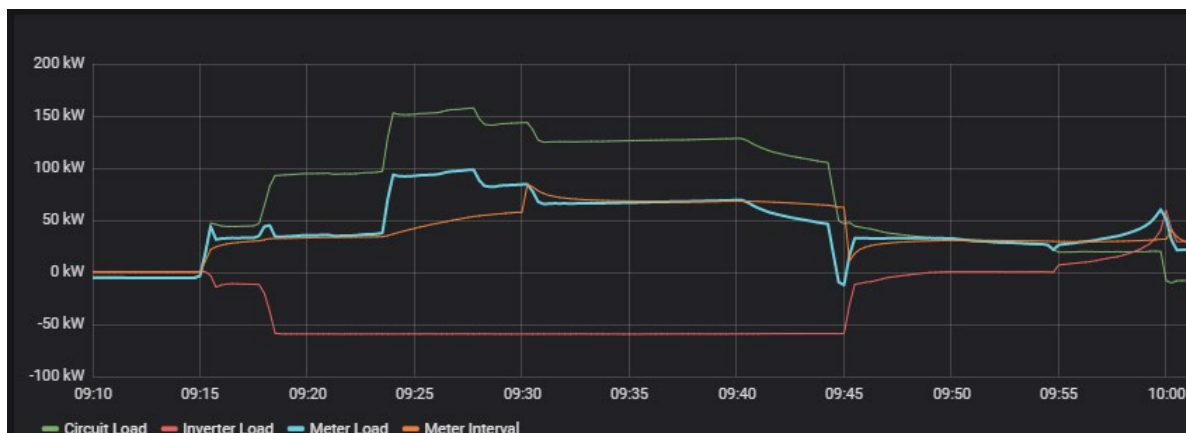
Image 4 (repeated): Vehicle is charging at 150 kW power level on high power charger at EVgo site.

EVgo will be setting up more controlled charger and vehicle testing now that the charging station is fully operational with all hardware in place. The goal of testing will be to determine the charge curves of different electric vehicle models on chargers of different power levels. This information on charge curves and charge times when combined with cost of different charge power levels will help inform policy makers and businesses when deciding what power level of chargers to invest in moving forward.